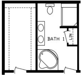
RO1 Opt Bath 1