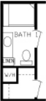
RO1 Opt Bath 1